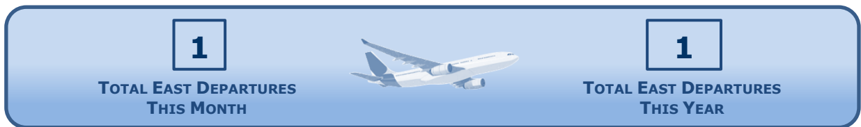
East Departures Yearly Comparison

The number of East Departures may vary from month to month due to weather, air traffic volume, and/or operational factors.