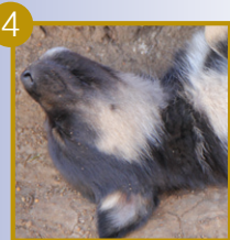
My Best Shot