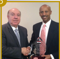
'Thanks' for Service