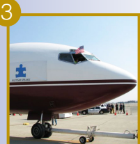
Annual Plane Pull