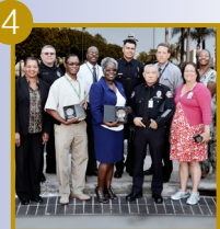
Honored for Service