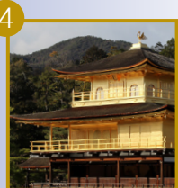
My Best Shot