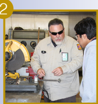
Job Shadow Days