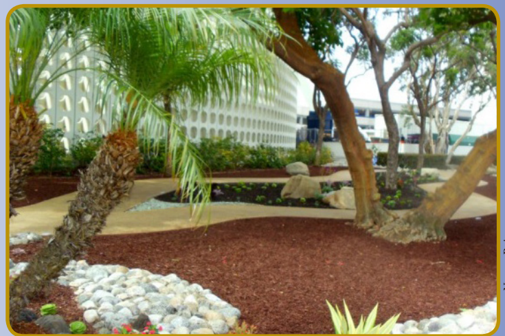
Water-Wise Project: Completed