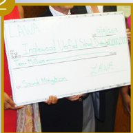
Sound Insulation Funds