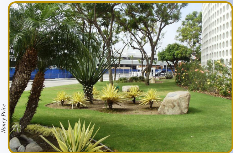
Water-Wise Project: Before

LAWA has developed plans to install drought-tolerant landscape, replace with turf, and reduce indoor water use at all three of its airports: LAX, LA/Ontario International (ONT), and Van Nuys (VNY), he added.