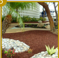
Theme Building Landscaping