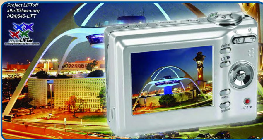
Photo Contest Deadline Nears

The annual LAWA Calendar Photo Contest is underway with a deadline for entries set for October 13.