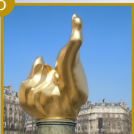
My Best Shot