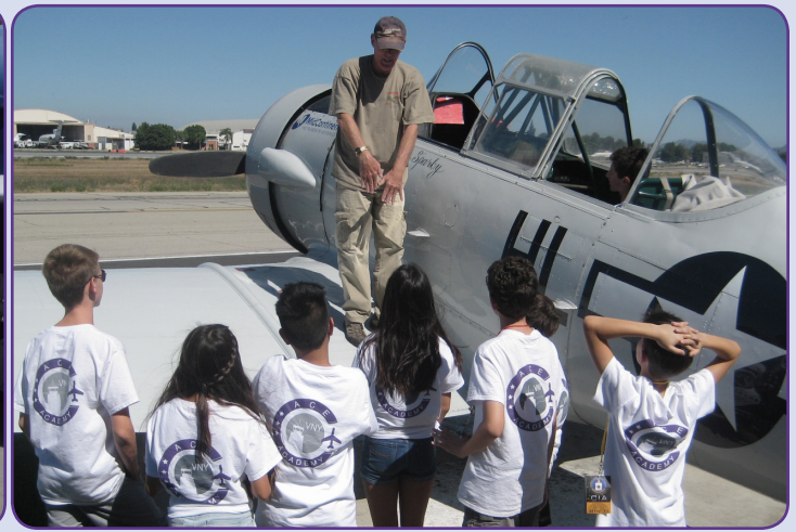
CONDOR LESSON —Seven of the ACE Academy students find out more about the AT-6 training aircraft, part of the Condor Squadron.