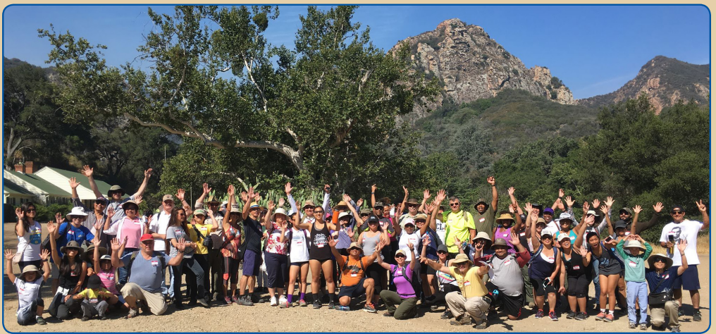
POPULAR ACTIVITY —A large group of LAWA employees, family and friends spent a day in June hiking at Malibu Creek State Park.