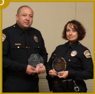
Airport Police Honored