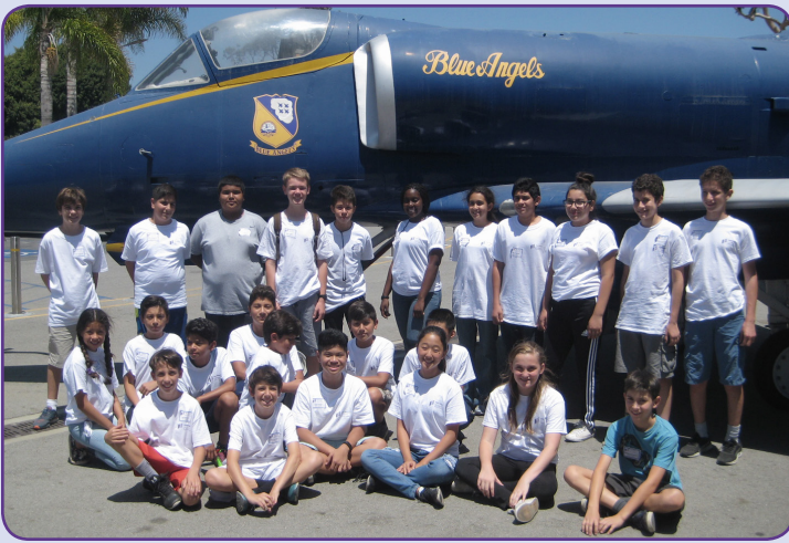
FLYING ACES —Members of the middle school Aviation Careers Education Academy pose with one of the Blue Angels' planes at the Santa Monica Museum of Flying.