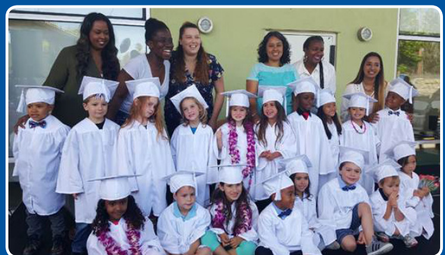
GRADUATES —Pictured are this year's graduates of LAWA's First Flight Child Development Center, who recently celebrated with a ceremony on June 10.

First Flight Child Development Center is operated by KinderCare Education CCLC West and is accredited by the National Association for the Education of Young Children.