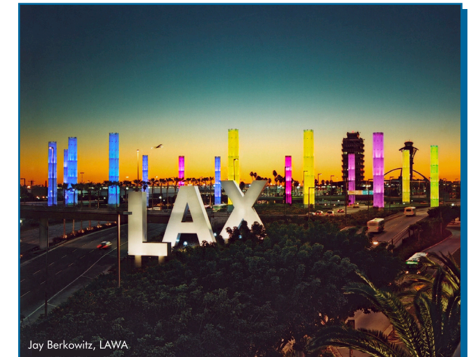
Jay Berkowitz, LAWA

To learn more about the contents of the SAIP Draft EIR, visit the LAWA web site at: www.laxmasterplan.org