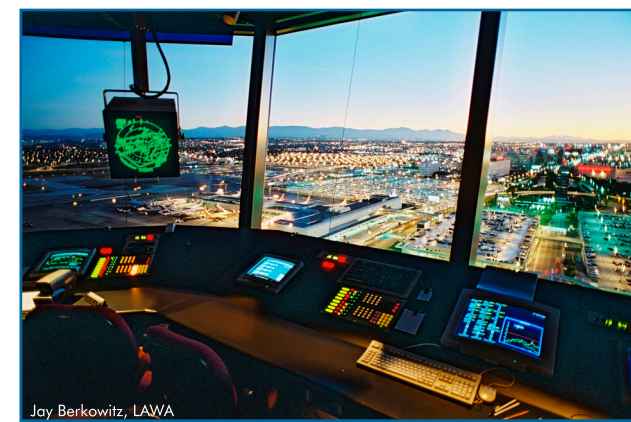
Jay Berkowitz, LAWA

The SAIP Draft EIR is "tiered" from, and incorporates by reference, the LAX Master Plan Final EIR. Given this structure, the SAIP Draft EIR need only evaluate potential impacts that have not already been fully evaluated in the LAX Master Plan Final EIR. To avoid a repetitive discussion of issues, the SAIP Draft EIR provides project-specific information on the construction of the SAIP, focusing on potentially