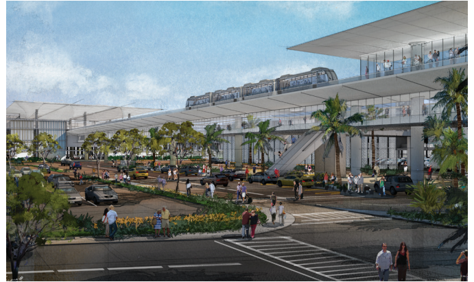
CONRAC CONCEPT – This rendering shows the concept for the Consolidated Rent-A-Car Center, which is one of the key components of the Landside Access Modernization Program (LAMP).

The project would be built using a Public-Private Partnership (P3), which would require the winning team to design, build, finance, operate and maintain the facility. Current plans envision a customer service building, access to an APM station, and parking for airport-wide employees and visitors. The ConRAC would accommodate three levels of ready/return, quick turn-around, and vehicle storage for rental cars and a ground level bus plaza (for potential shuttle bus operations in case the APM is unavailable) with a vertical transportation core providing access to the customer service building.