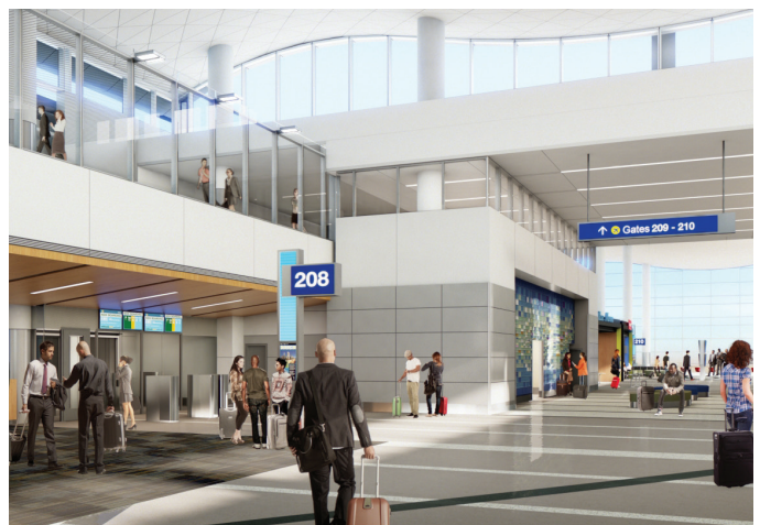
NEIGHBORHOOD NEWS – The Midfield Satellite Concourse will include several “neighborhoods” of 3-4 gates grouped with retail and dining establishments and a restroom core.