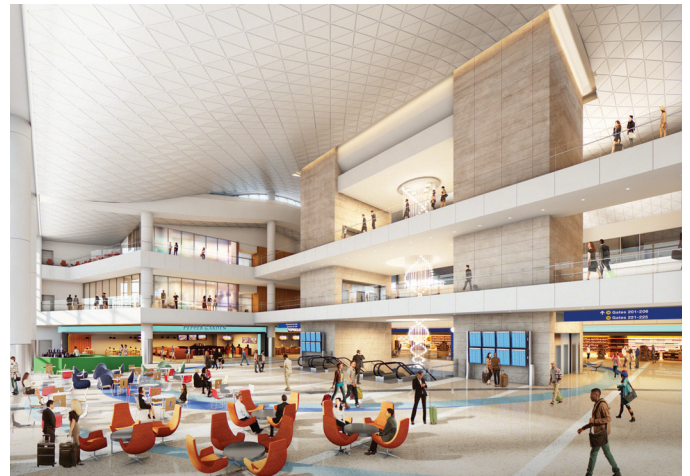
OPEN SPACE – The Central Hall, shown in this rendering, will welcome guests to the Midfield Satellite Concourse.