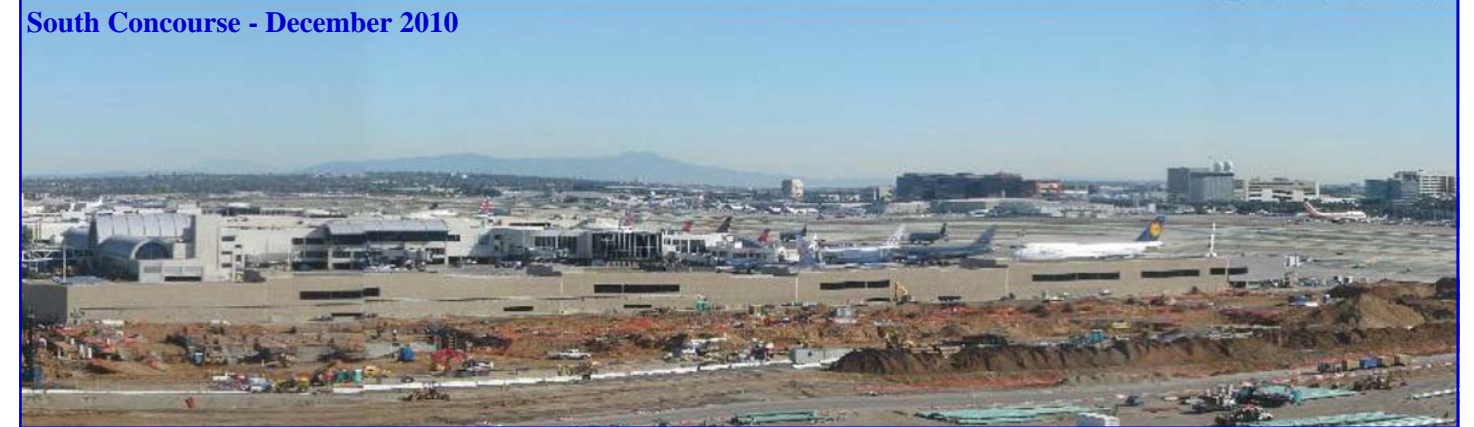
South Concourse - December 2010

enclosed with the roof, metal panel and glass curtain wall. Gate 134, shown above, will contain three passenger loading bridges to accommodate the Aircraft Design Group VI and is scheduled to be operational September 2012.