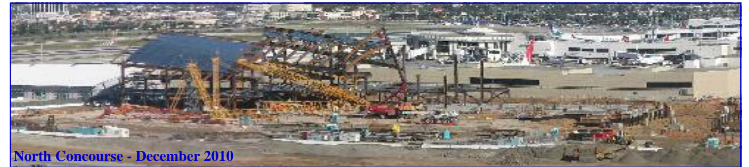
North Concourse - December 2010