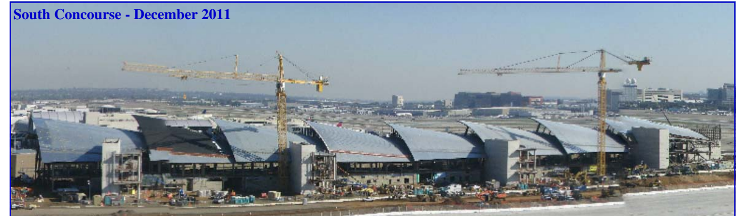
South Concourse - December 2011