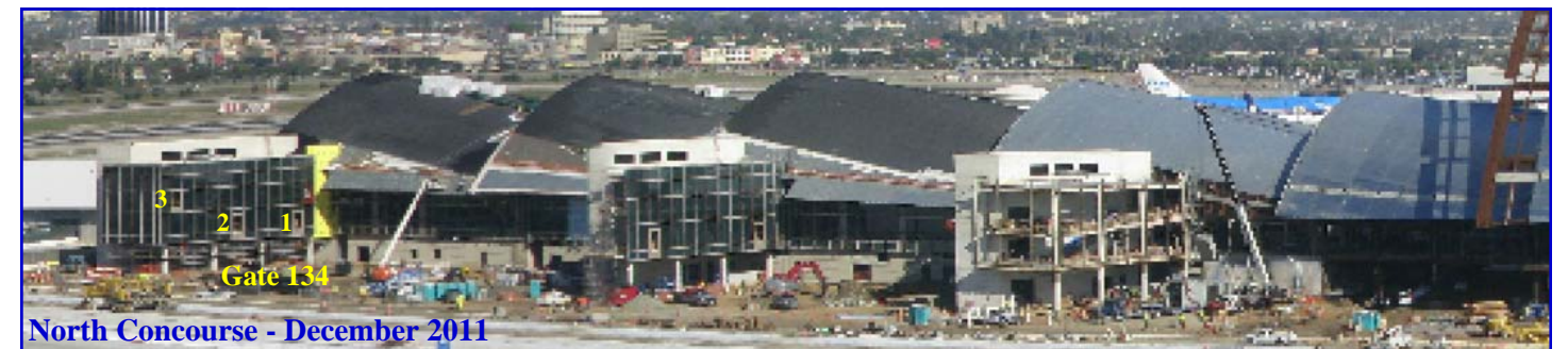
North Concourse - December 2011

The North Concourse structural steel began in November 2010 with the start of the South Concourse following in January 2011. One year later both concourses are complete with structural steel and are in the process of being