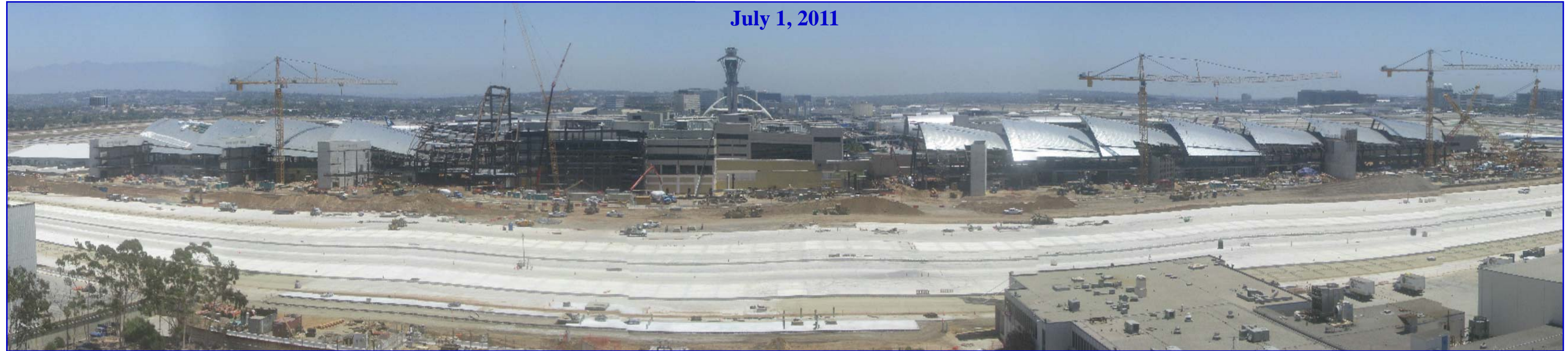
July 1, 2011