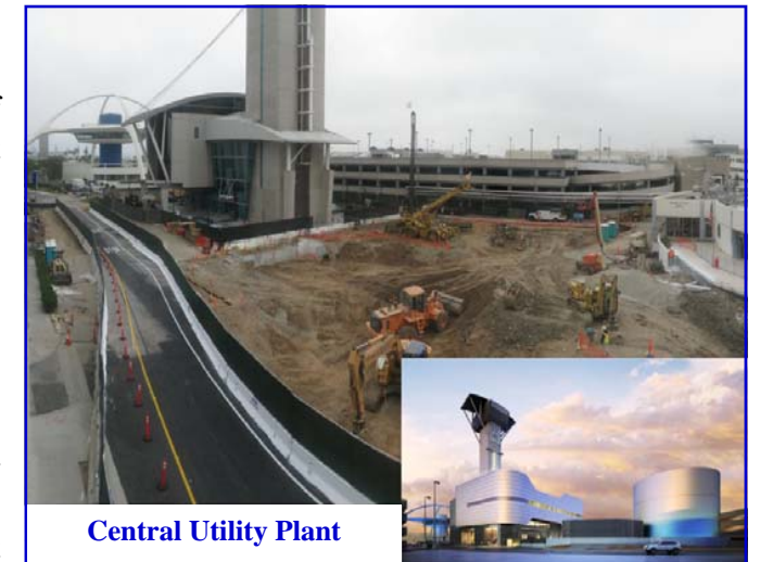
Central Utility Plant

With an extremely aging infrastructure at LAX, the construction