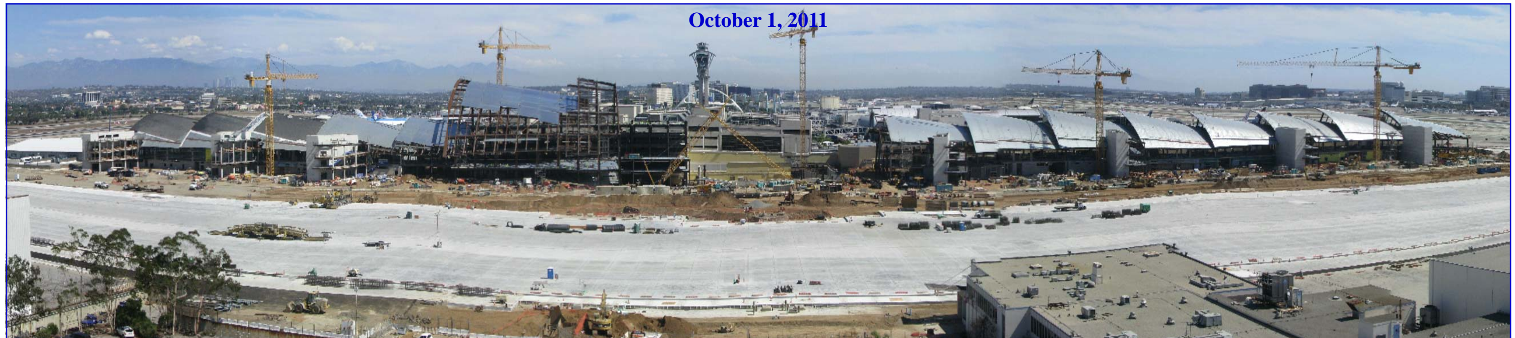
October 1, 2011