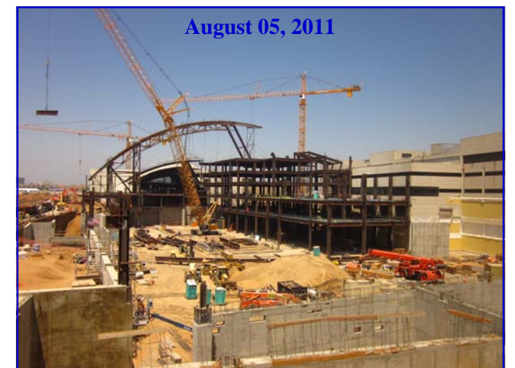
August 05, 2011