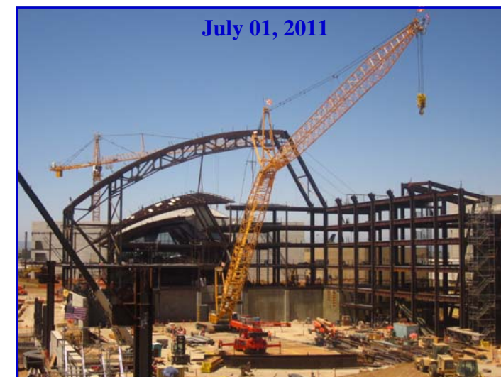
July 01, 2011