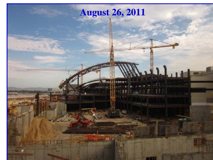
August 26, 2011