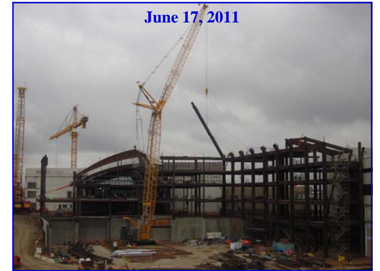
June 17, 2011