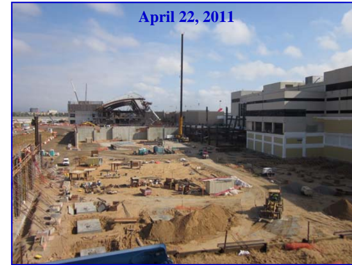
April 22, 2011