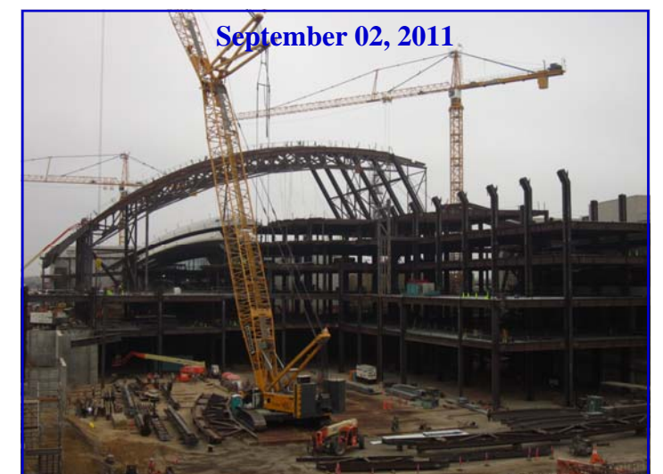
September 02, 2011