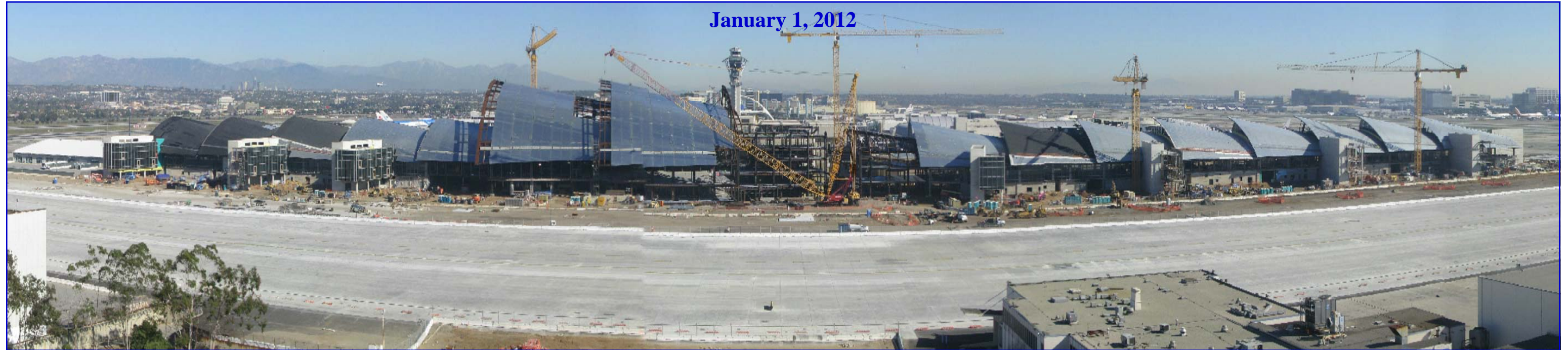
January 1, 2012