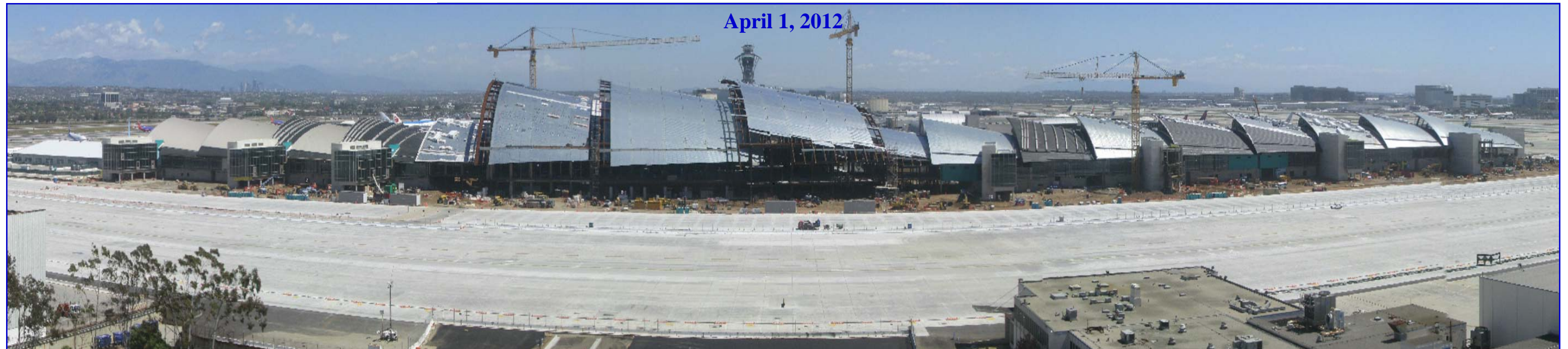
April 1, 2012