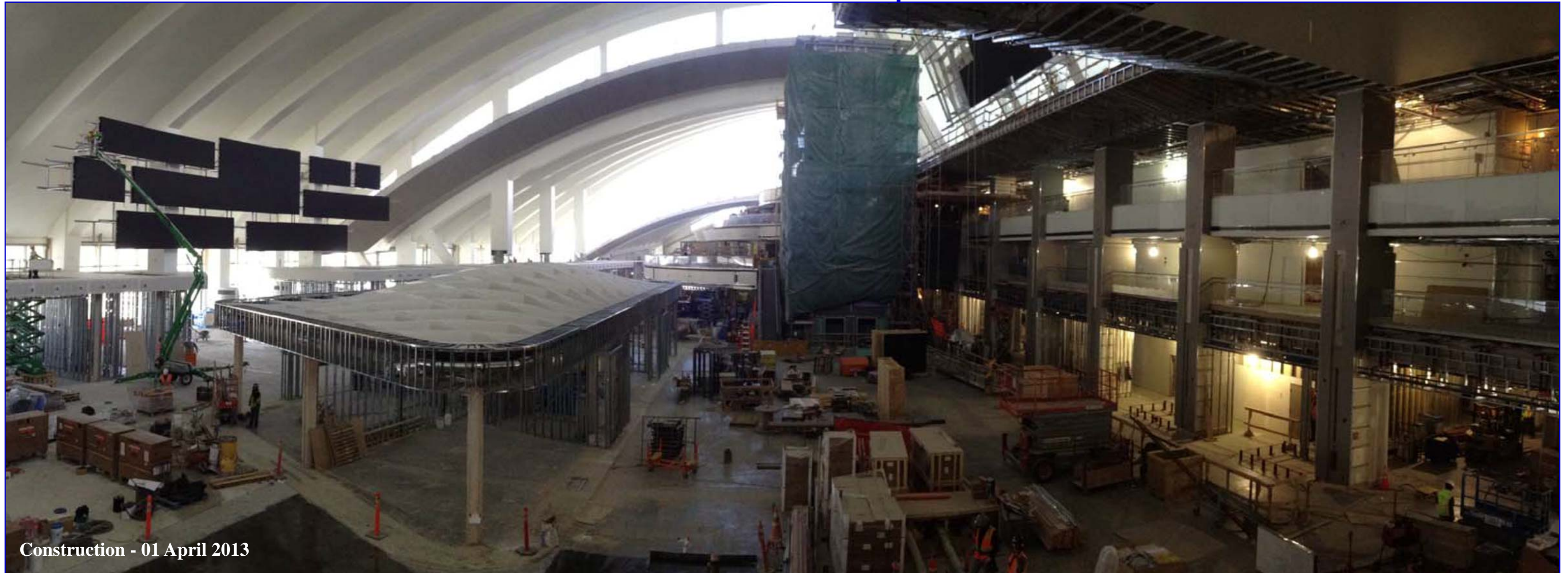
Construction - 01 April 2013