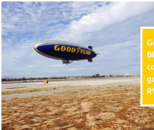
Good Year Blimp conducts a go-around RWY 24L