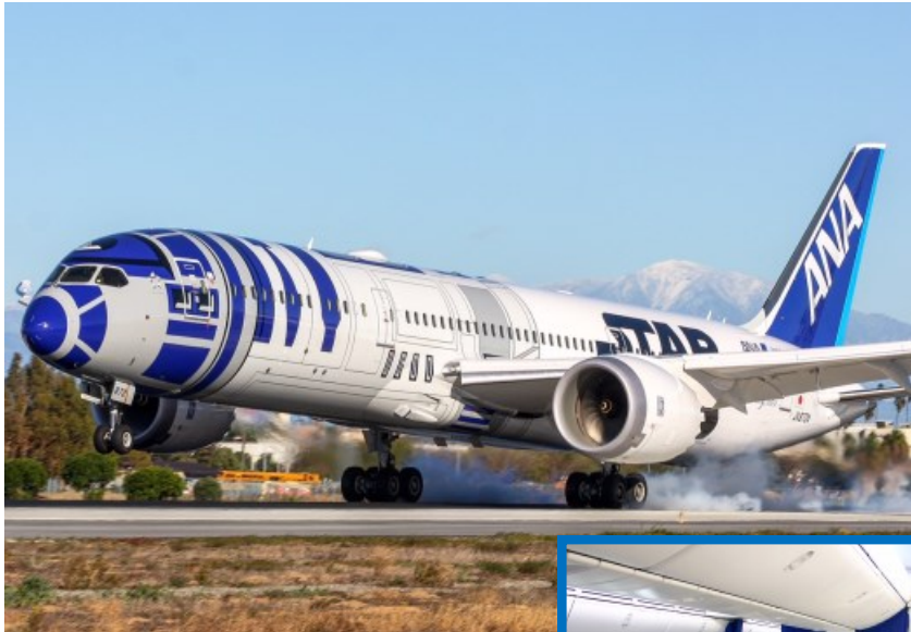
T. Lawrence (LAWA)