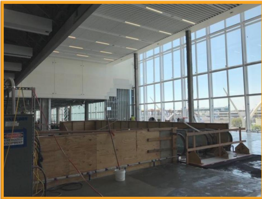
Terminal 1.5 Escalator Installation (Level 2)