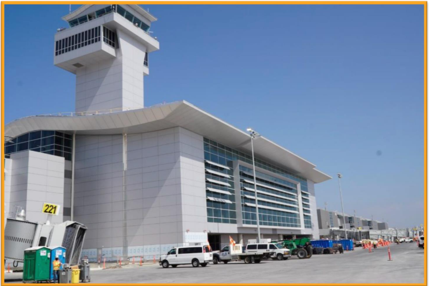
MSC Exterior from Airfield