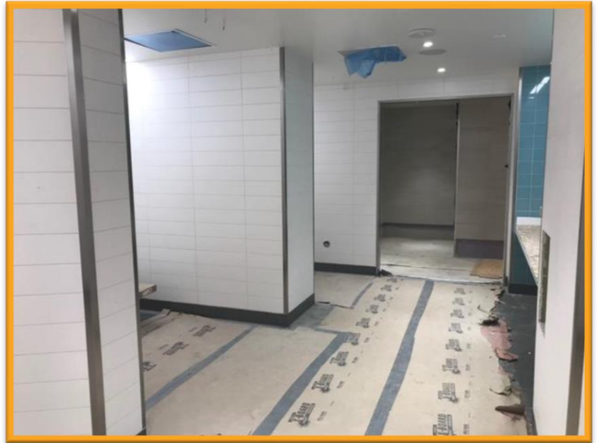
Terminal 1.5 Restroom Construction