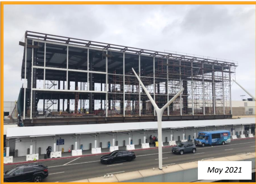
Terminal 5.5 Progress from December 2020 to May 2021