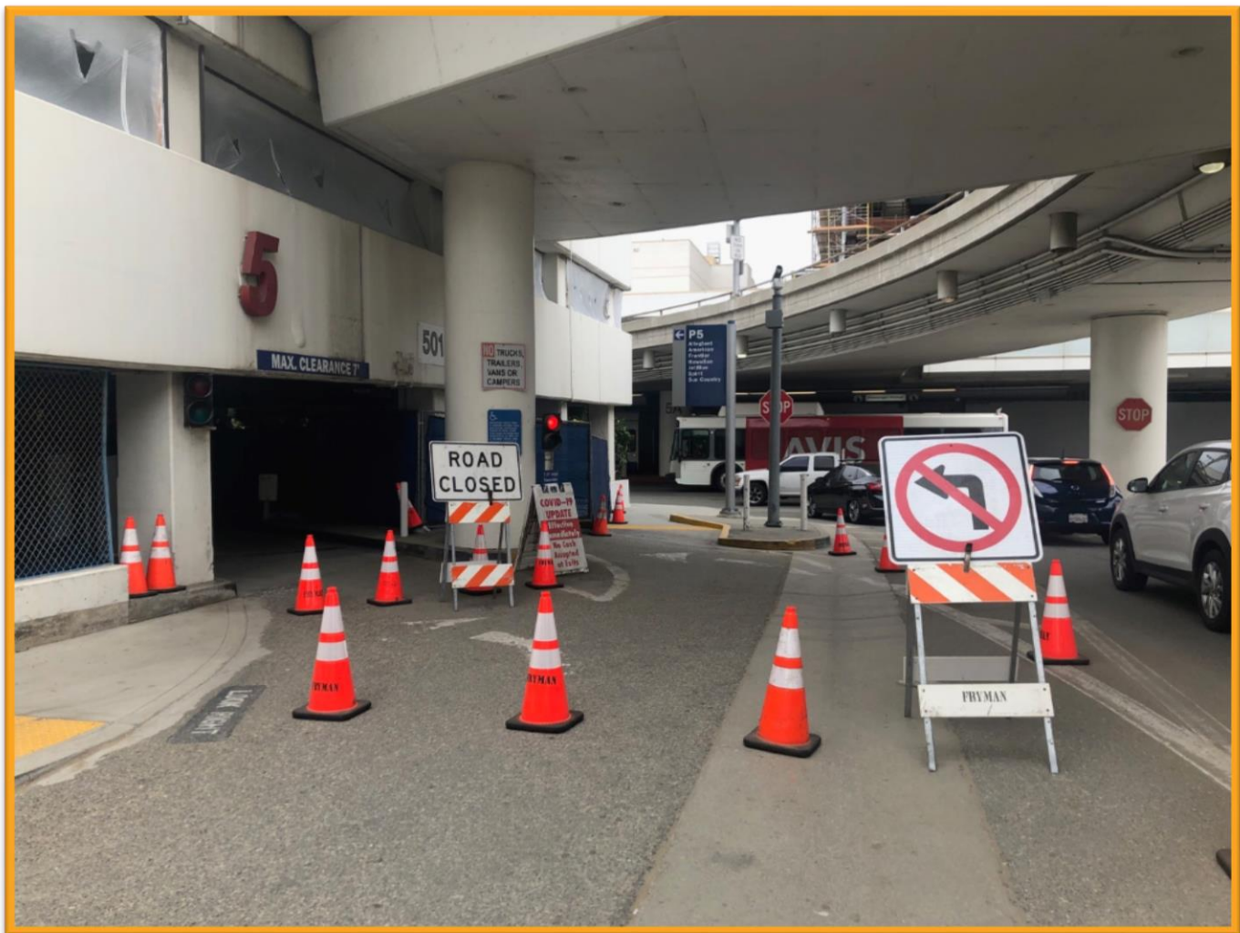
Parking Structure 5 Arrivals Entrance Closed through 5/14/21